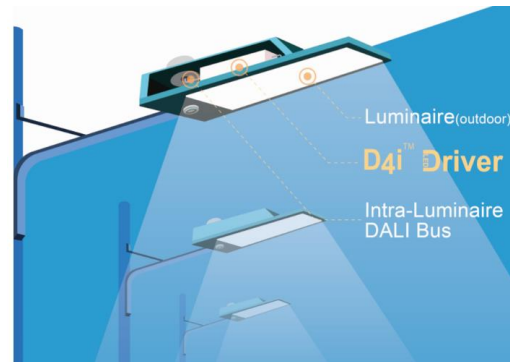
Figure 2: Intra-Luminaire Applications: DALI-2 bus does not leave the luminaire