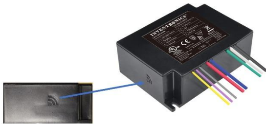
Figure 2: Radio Location Indicator

Programming your Inventronics NFC LED driver is fast and efficient. Each NFC LED driver has a radio location indicator on the driver (Figure 2). Simply line up the NFC reader with the radio location indicator and read/write as normal using the Inventronics Multi-Programmer software . Inventronics does offer a handheld (Figure 3) and desktop programmer (Figure 4) for added convenience, but any NFC programmer that adheres to the Zhaga Book 24 specifications is supported.