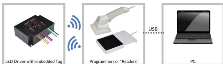
Figure 1: NFC Programming System

NFC is a wireless technology globally available in the 13.56MHz unlicensed radio frequency range and is designed for short range data transfer. It is currently used in a variety of applications such as “point-of-sale” devices, parking meters, turnstiles, garage doors and mobile devices. NFC communication requires two devices, an NFC reader and an NFC tag. The NFC tag is typically embedded in a device, such as a turnstile or LED driver. The NFC reader is designed to read and write information to the NFC tag and is often embedded in a smartphone, or a standalone unit that connects to a PC. In Figure 1, you can see the reader is connected to a host PC that uses software to transmit programming data between the reader (or programmer in this case) and the tag embedded in the LED driver.