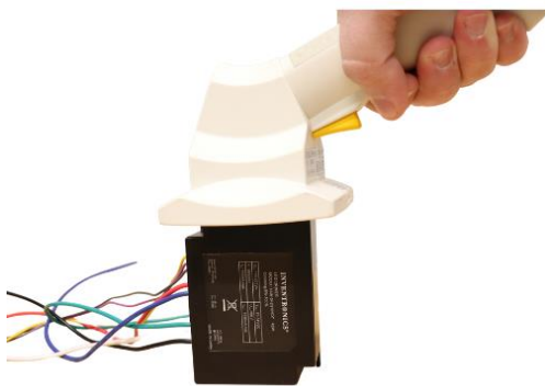
Figure 3: Handheld NFC Programming Device